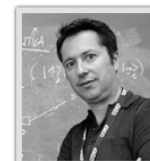
IGNACIO CIRAC Max Planck Institute of Quantum Optics